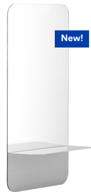
Horizon Mirror Vertical