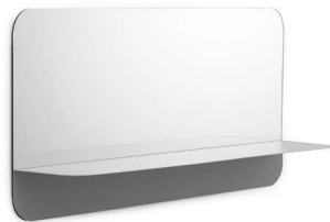
Horizon Mirror Horizontal