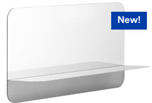
Horizon Mirror Horizontal