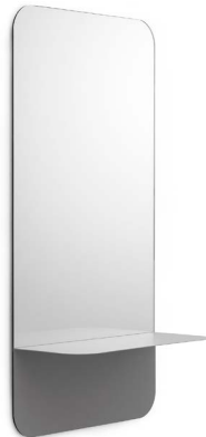
Horizon Mirror Vertical