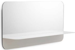
Horizon Mirror Horizontal