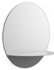
Horizon Mirror Round