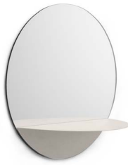
Horizon Mirror Round