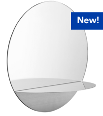
Horizon Mirror Round