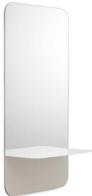
Horizon Mirror Vertical